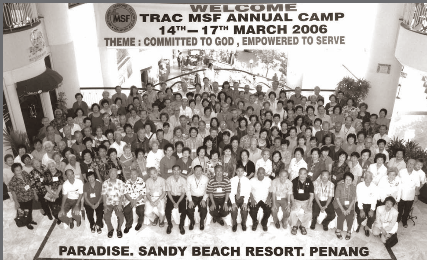
Participants at TRAC MSF Annual Camp 2006