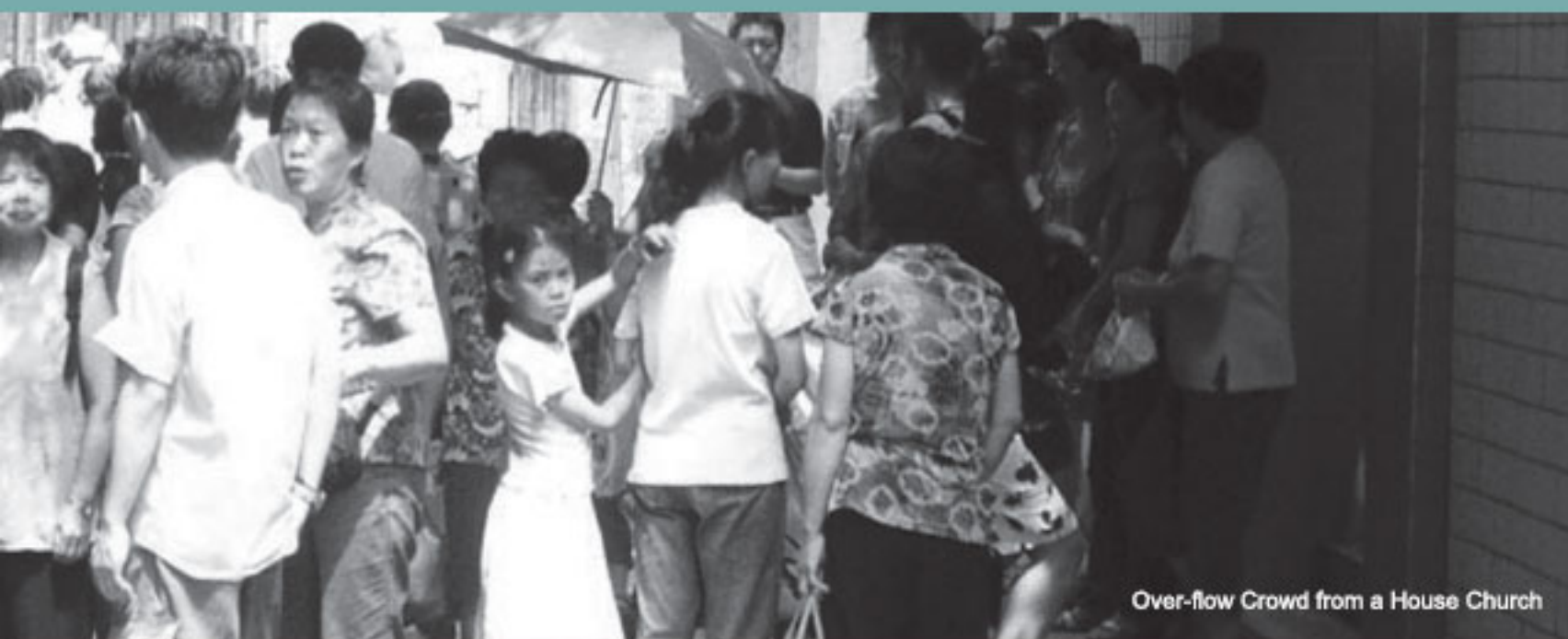
Over-flow Crowd from a House Church

for the churches are: (i) official, registered or TSPM church, and (ii) unofficial, unregistered, underground, or house churches. TSPM stands for "Three-Self Patriotic Movement" to which all registered churches belong. Neither the TSPM churches nor the house churches are homogeneous. As we were to find out, they vary from place to place, and both groups have differences among themselves. We also found out that, while there is no official interaction between the leaders of the registered and unregistered churches, quite a number of believers actually attend both kinds of churches.]