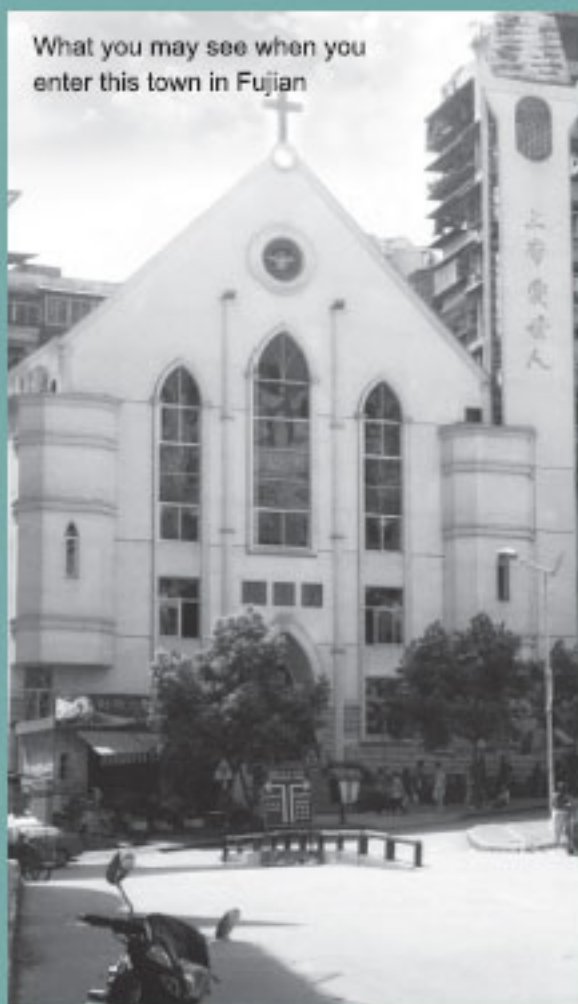
What you may see when you enter this town in Fujian

in China - the work of pioneering Methodist missionaries. We had to walk through several small alleys to reach it,