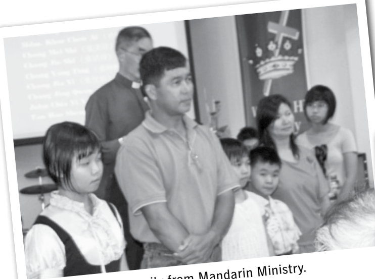
The family from Mandarin Ministry.