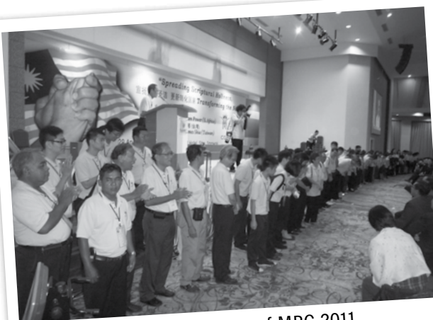
Organising Team of MPC 2011