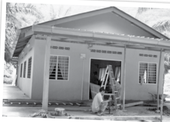
A new chapel equip with basic facilities.

The work of building the chapel started in mid September 2010 with 5 half-paid workers. After 3 months of intensive work and many weekly trips to supervise the progress of the building, the chapel 24ft x 60ft with sitting capacity of 100 and equipped with basic facilities was finally completed in mid of December 2010 with a total cost about 62K.