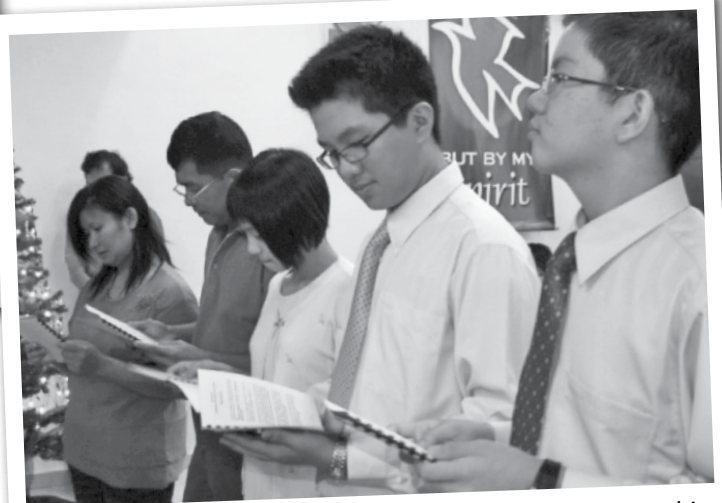
Confirmation of faith and received into church membership.

The family – seven in all and together with two other children from the church school was baptised.