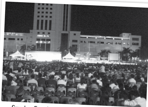
Sunday Evening Service at Sibu Town Square.