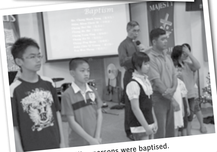
Nine persons were baptised.