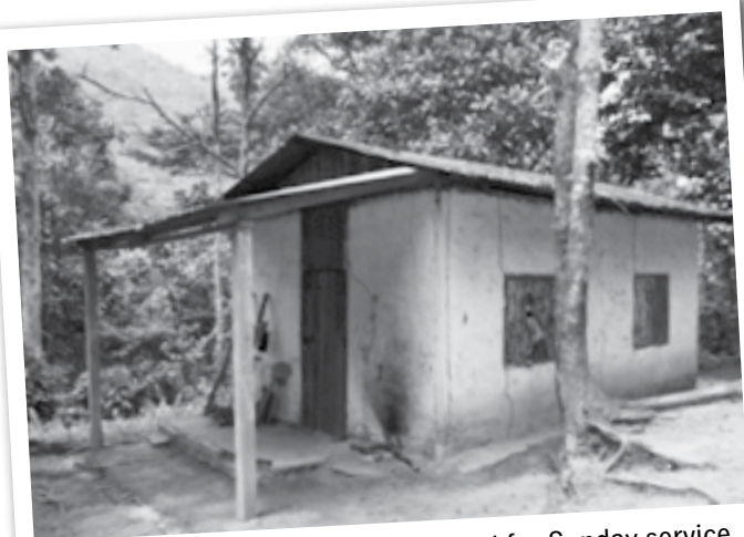
The run down chapel (10 x 14 ft) used for Sunday service.