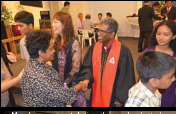
Members congratulating the newly elected President and Bishop