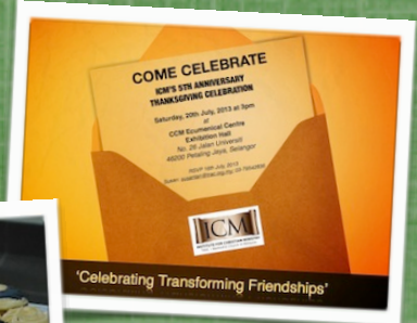
From left: Guests group photo, Anniversary "Cup Cakes", Invites