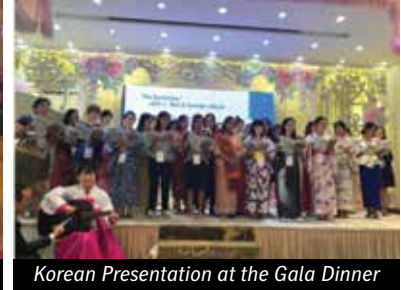
Korean Presentation at the Gala Dinner