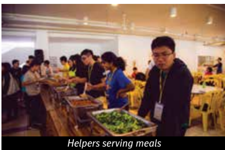
Helpers serving meals

We truly thank God for the committee and helpers for their tireless effort without which this camp could not have operated. But, all glory to God for the change that has begun in the lives of some of these youths.