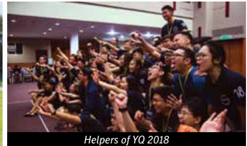
Helpers of YQ 2018