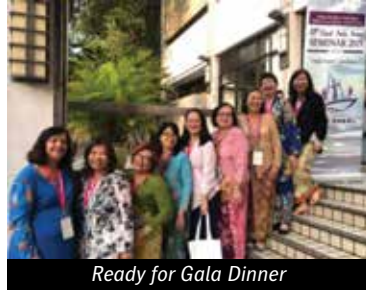
Ready for Gala Dinner