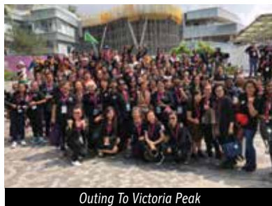
Outing To Victoria Peak