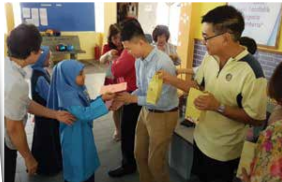
Giving out the goody bags to students