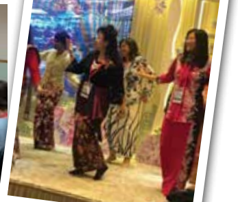
Malaysian Presentation at the Gala Dinner