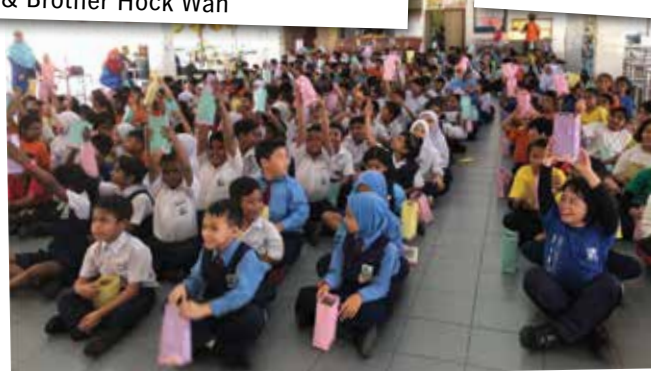
Students with the good bags