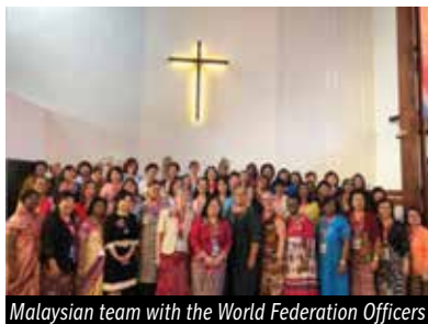
Malaysian team with the World Federation Officers