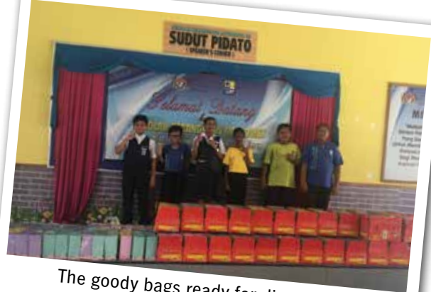
The goody bags ready for distribution