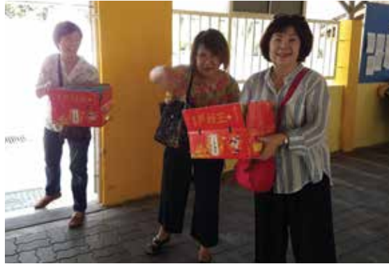
Transfer of goody bags to SK Methodist PJ