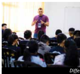
Different Workshop sessions