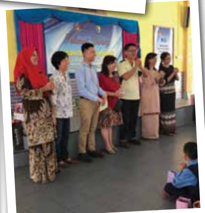
Members of TMCPJ with teachers of SK Methodist