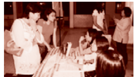
ICM Info Counter

FOUR pretty maidens in a row representing three different churches – a common scene in the lecture series. At a random count, the ICM Lectures drew participants from over thirty churches in the Klang Valley. We continue to be attentive to the work of God in the hearts of men. How refreshing for the soul to witness the Spirit's movements having His way in His larger Body of Christ – irrespective of denominations and traditions!