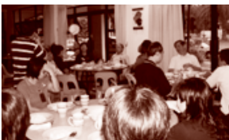
SFL Gopeng sharing a meal Harvest Haven, Gopeng

Located on a fenced area of 6.8 acres, the campsite - Harvest Haven appeared like an oasis popping out of a monotonous listless plantation landscape. It boasted of a swimming pool, football field, basketball/volleyball/futsal court and table tennis table. Alas, none of these facilities were enjoyed as the participants were not supposed to talk, gesture or even have eye contact with each other when they practiced the 'disciplines of Solitude and Silence' [one would be allowed to scream, "Fire! Fire!, ...etc" if the need arose]. Here, I must confess that I 'cheated' a little, sometimes nodding and smiling upon receiving a simple courtesy from other participants, most of whom were equally amateurish in playing the role of monastic monks.