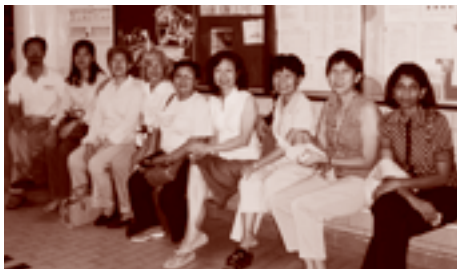
Contingent from Taman Ujong Methodist Church Seremban