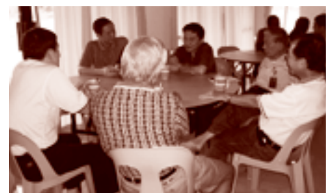
Coffee break and Fellowship.

In another session, the participants were invited to reflect on the whole of their life story and to identify their strengths and weaknesses. St. Augustine wrote that 'Man possesses wisdom through dual knowledge – the knowledge of God and the knowledge of self'. We were also introduced to the need to schedule our lives in a realistic and practical manner, by integrating spiritual disciplines in our lives suitable to our life stage, personality and interests. In other words as good stewards, we need to know our body