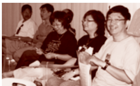
Participants at SFL Gopeng.

I could not help but compare this to my own medical practice of 'insisting' that very vertiginous (giddy) patients be admitted in the hospital for complete rest in bed. I know from experience that if I were to allow these patients to go home, they would not be resting in bed but rather be pandering to the needs of their family or sneaking in some home/work chores! The more they force their bodies beyond their limit, the sicker they become and the longer they will need to finally recuperate. So also, a period of silence and solitude is very often NECESSARY to rest one's soul and allow it to rejuvenate and bask in