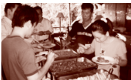
Sumptuous food at El-Sanctuary, Alor Gajah

SFL 2 will be held from 6-8 August at Stella Maris, Penang and 2-4 Oct at Methodist Centre, Fraser’s Hill. Part 2 of this SFL Weekend will focus on building Personal Leadership Skills for Leaders. The focus is on looking at leadership skills from a spiritual formation perspective. For more information, please visit www.trac.org.my and the Institute for Christian Ministry link or CALL 03-7954 2836 (ICM)