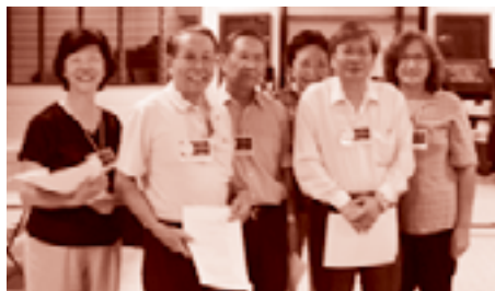
Ushers from Trinity Methodist Church PJ