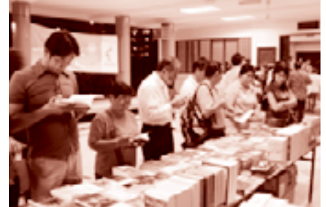
SUFES Book Table