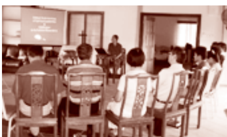
Attending a teaching session at SFL, Alor Gajah