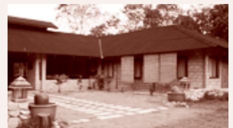
El-Sanctuary, Alor Gajah

I met with GOD in the stars that night at El-Sanctuary (God’s Hiding Place).