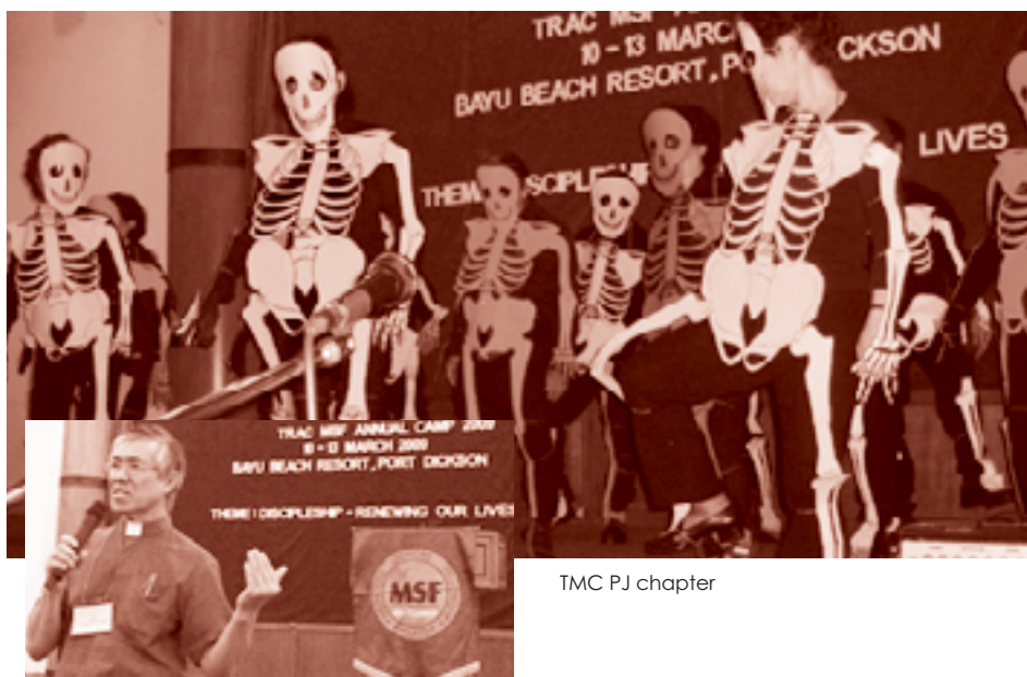
TMC PJ chapter