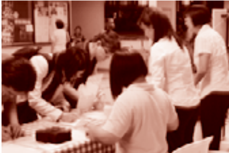
Placing Orders for CD's