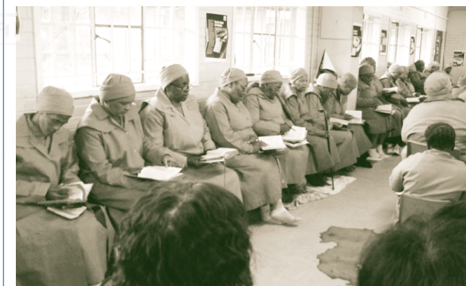
Members of the "Believers in Christ" congregation

In the afternoon, we headed for the town of Soweto, a black African township, to participate in worship with