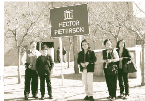
In front of Hector Pieterse museum

during the 1976 student uprising. White policemen had confronted the marchers and that confrontation turned violent resulting in the death of many students. What was a student march, quickly erupted into an uprising, which spread to many parts of the country. A photograph of a young man, Mbuyiswa, carrying the critically injured Hector Pieterse in his arms, captured the attention of people throughout the world and highlighted the injustices of apartheid.