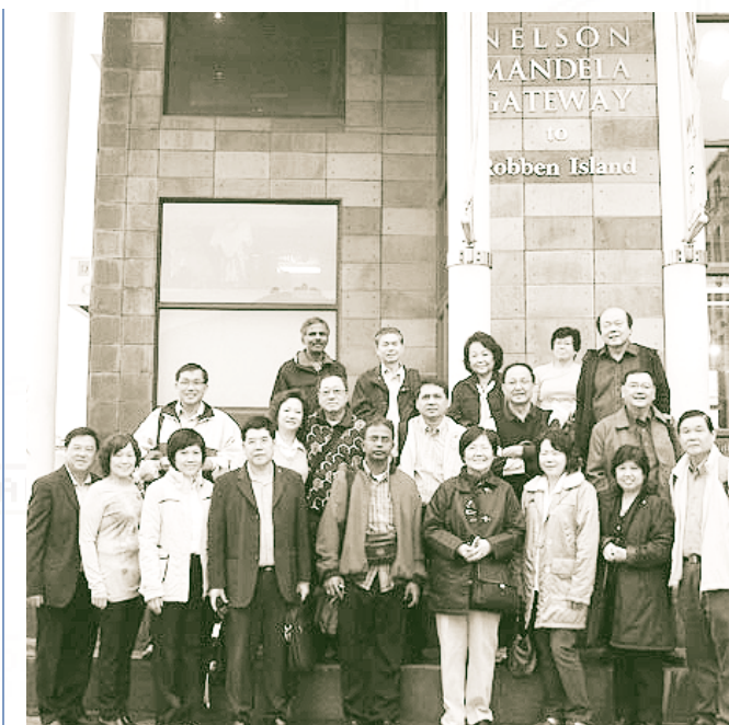
Group photo before departure by ferry for Robben Island

We were whisked to the Indoor Sports Arena, The Bellville Velodrome where we participated, together with representatives from over 200 countries, in the 10th Anniversary Celebration of the Global Day of Prayer . The stadium was packed with people from different nations, denominations, colour and race. All came together, answering God's call for a day of repentance and prayer on Pentecost Sunday. I felt the outpouring of God's Holy Spirit as the people called on Him in prayer and lifted their voices in praise. The music was LOUD but somehow suitable for the beat and rhythm of the choruses that were sung in English or other indigenous languages. I was not unduly bothered by the loud music although I could feel the intense palpitation of my own heart! Invited representatives