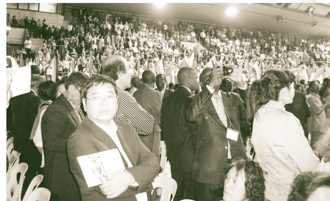
GDOP: Flags of different nations carried around the stadium