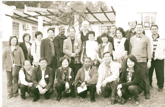
At African Enterprise Retreat Centre

(green) they wore to church and that some of the men carried sticks which represented the staff of Moses. Healing ministry is carried out before each worship service for they believe that all worshipers must be cleansed of sickness, evil spirits and family breakdown before they worship God. Such is an example of an indigenous Church that believes that Jesus can fulfill African tradition and can be worshiped in terms of African culture. The Good News of Jesus Christ can and does bring holistic deliverance from evil which Africans long for and this is an aspect which the independent