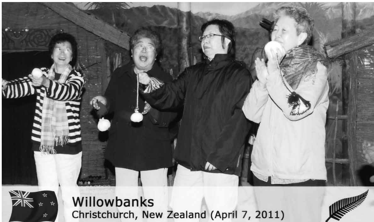
Willowbanks Christchurch, New Zealand (April 7, 2011)

The Life MSF group from Puchong made a trip to New Zealand. Here are accounts from two different members.