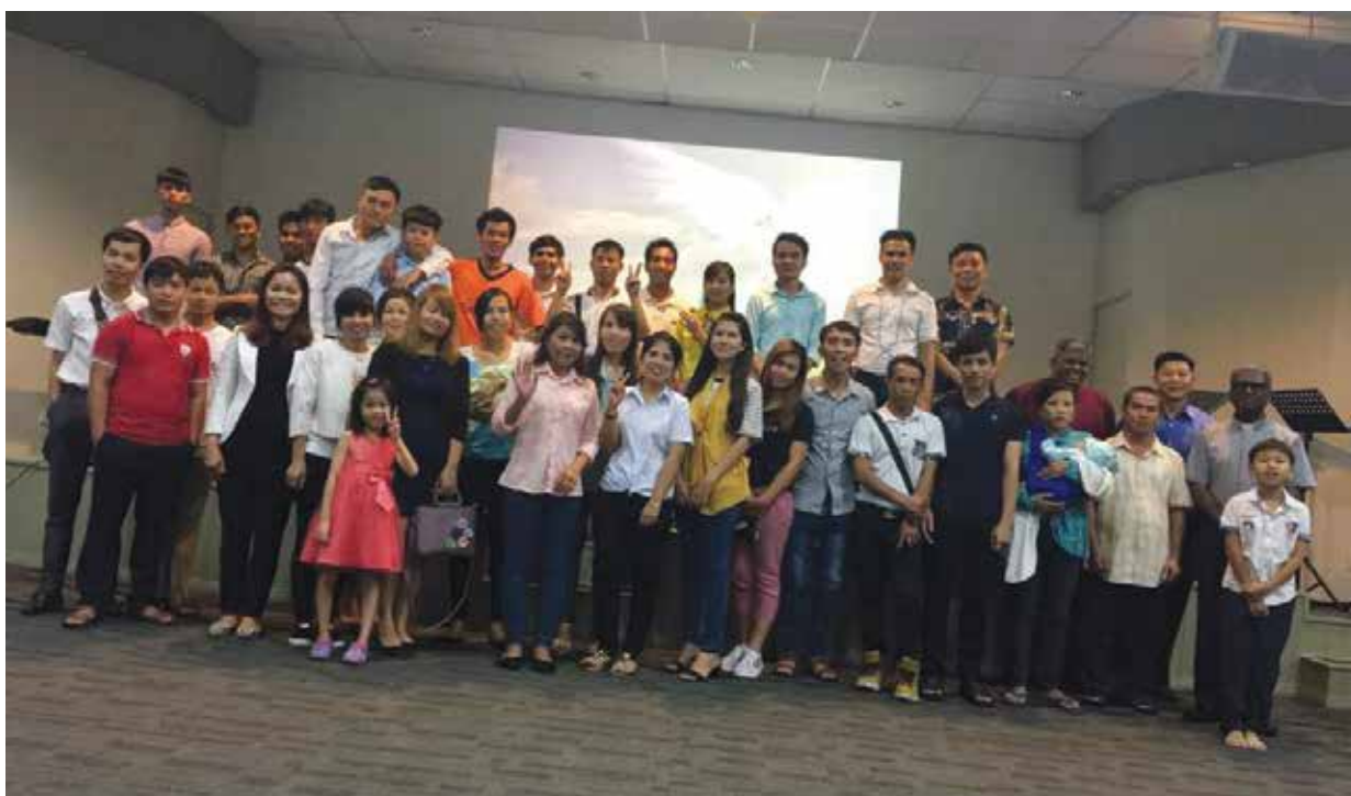
Vietnamese Service in Living Word Preaching Point, Klang 29th October, 2017