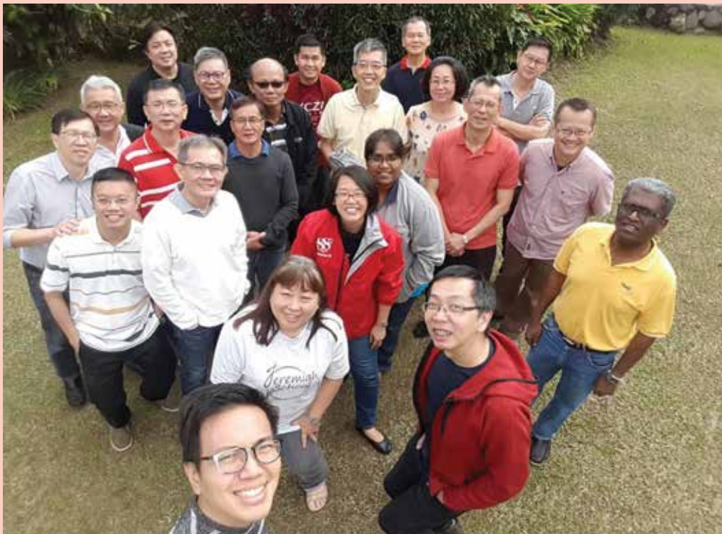
The Probationary Pastors' Retreat was held on 8-10 August 2017 at the Methodist Bungalow in Fraser's Hill. The retreat was attended by 22 pastors, including 3 facilitators.