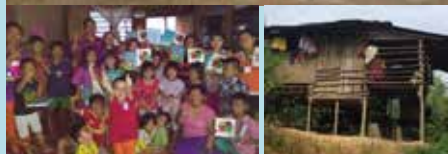
Rumah Harapan (Student Hostel) & Tadika for orang Asal children in Sabah