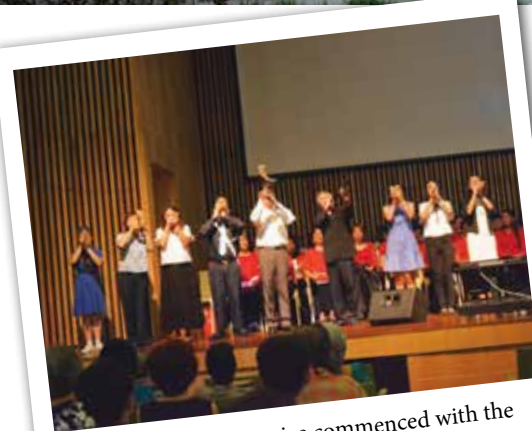
The Dedication service commenced with the blowing of the shofar

Trinity Living Stream is a three-and-a-half level extension of TMC PJ with about 60,000sq ft of space.