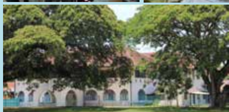
Emmanuel Golden Years Retirement Residences in Malacca & Klang Valley