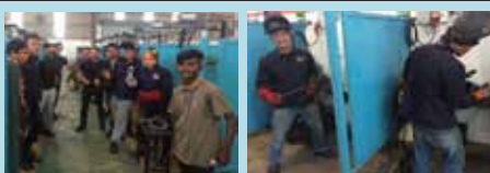
Vocational Skills Training for Orang Asal from East Malaysia

7 JULY 2018 : 10 AM-3PM SJK(C) YUK CHAI JLN SS23/19 TAMAN MEGAH PETALING JAYA