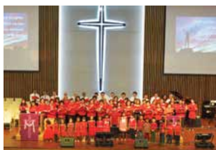
The combined Sanctuary choir comprising the Church choir and children from the Trinity Methodist Kindergarten.