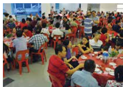
The fellowship dinner that followed the service took place on the Upper Ground floor of the building