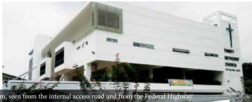
The exterior of Trinity Living Stream, seen from the internal access road and from the Federal Highway.