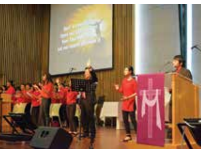
The worship team leading the congregation to sing a new song unto our Lord: An original composition entitled 'A New Thing'.