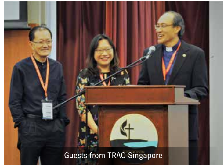
Guests from TRAC Singapore