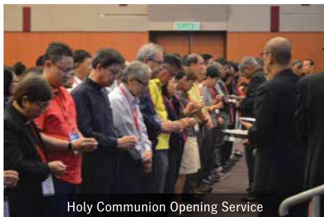
Holy Communion Opening Service