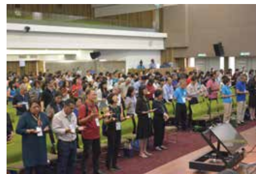
Praise & worship