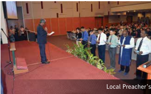
Local Preacher's Licence recipients