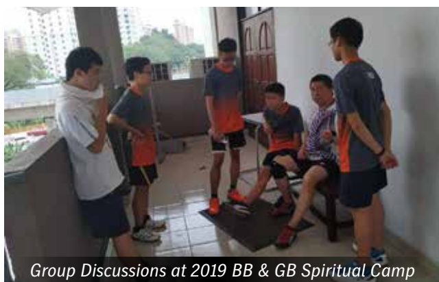
Group Discussions at 2019 BB & GB Spiritual Camp

Because the BB is the only Christian uniformed organization that makes it their objective to: advance(ment of) Christ kingdom among Boys and promote habits of: Obedience, Reverence, Discipline, Self-Respect and all that tends towards true Christian Manliness.