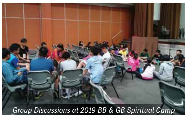
Group Discussions at 2019 BB & GB Spiritual Camp

"He was a young Sunday school teacher who worry that the Boys in his class were rowdy and he had difficulty keeping his class quiet in order to teach them. But on Saturdays, as an Officer in the Volunteers (part of the army in 1870's) he could get a hundred men obey his every word of command yet he could do nothing with a small group of lively Boys. Why couldn't the Boys in his Sunday school be like the Volunteers." (Senior Section Handbook, The Boys' Brigade Malaysia, Sixth Edition, p. 14).