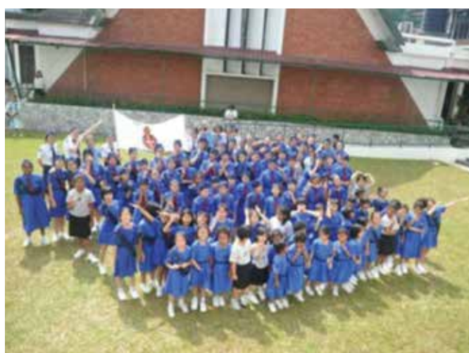
1st PJ GB Enrolment Day