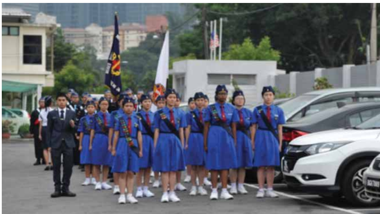
A combined 1st PJ BB & GB Guard of Honour Parade

... GB has taught me that it is never too young to reach out, to share God’s love, to be humble and obedient and to help one another”. Ecclesiastes 12:1 says Remember your Creator in the days of your youth, before the days trouble come and the years approach when you will say “I find no pleasure in them” –. GB has made a great impact on me and my desire to know more about Jesus and how to have a servant heart.”