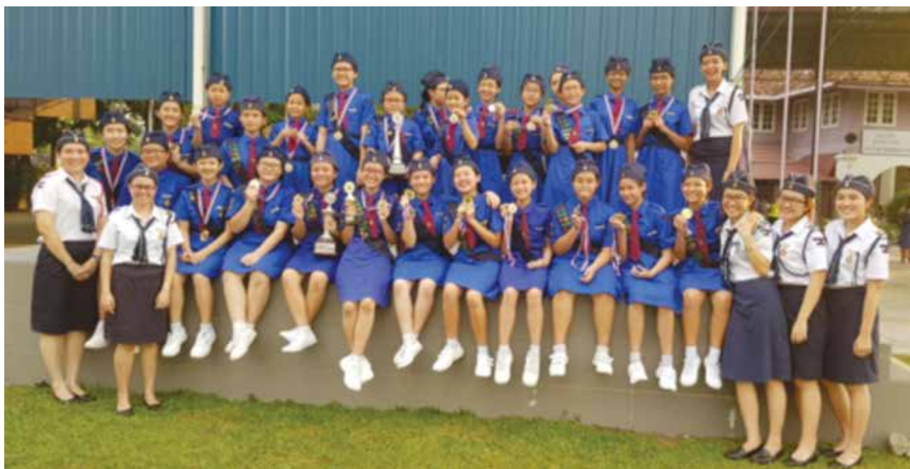
1st PJ GB coming out as Champion for both Junior and Senior/Pioneer sections in the Selangor & Federal Territory Drill Competition.