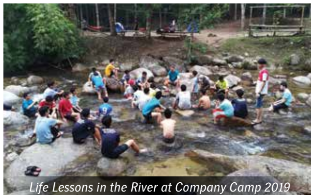
Life Lessons in the River at Company Camp 2019