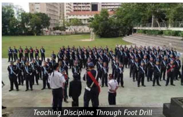
Teaching Discipline Through Foot Drill