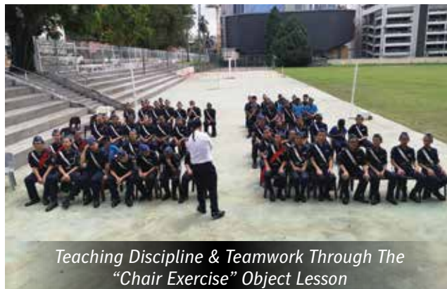
Teaching Discipline & Teamwork Through The "Chair Exercise" Object Lesson

Are you a parent trying to develop your son(s) into an all-rounder? Are you a church member and wonder what the youths are struggling with? You're about to find the answers.