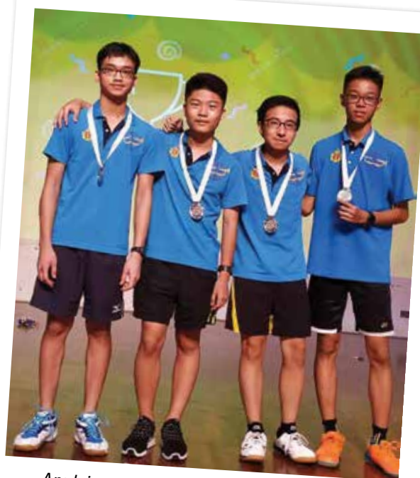
Applying good sportsmanship and giving their best made the badminton team silver medalists at Kul Games 2019