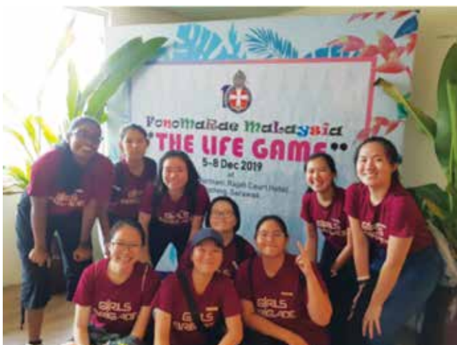
1st PJ GB Pioneer girls attending the 10th GB Fonomarae 2019 in Kuching