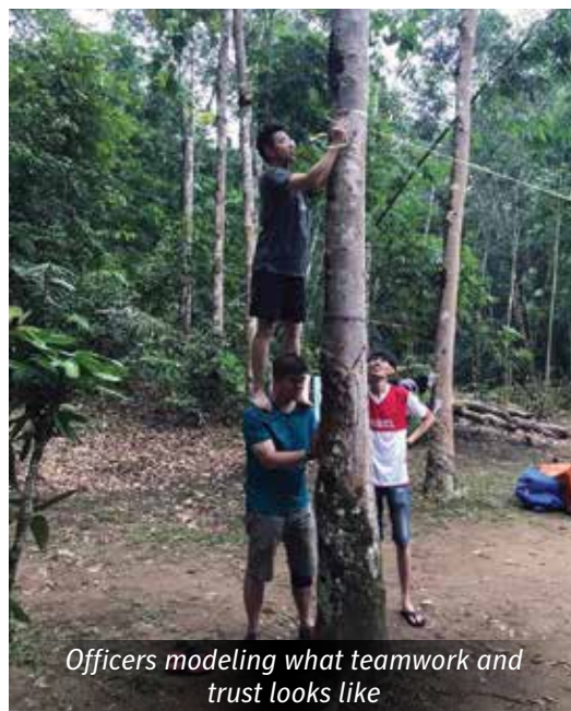
Officers modeling what teamwork and trust looks like

Where do we start? If you are a parent desiring your son(s) to be all-rounders, encourage them to sign-up at the nearest BB Company (more info at www.bbmalaysia.org ). If you are a church member and wonder what the youths are struggling with, you can find the answer from an active BB Officer who serves every week. The fact that you are asking the question may indicate that God has given you a burden for young boys to know Christ. You may find fulfillment for your calling as a BB Officer. I made this decision years ago. And though I have had highs and lows along the journey, but still, I have no regrets since.